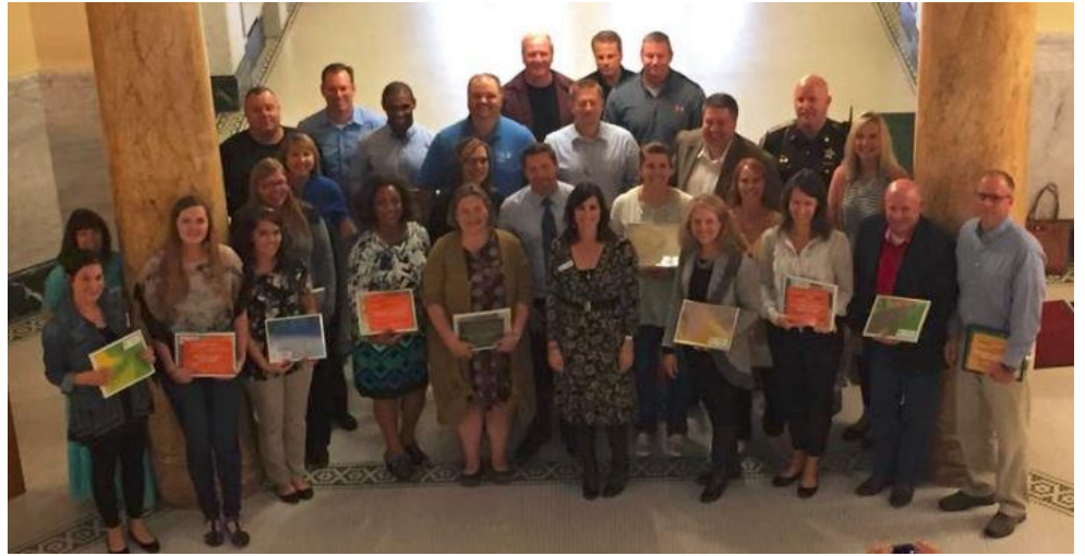
2017 BCL Graduation